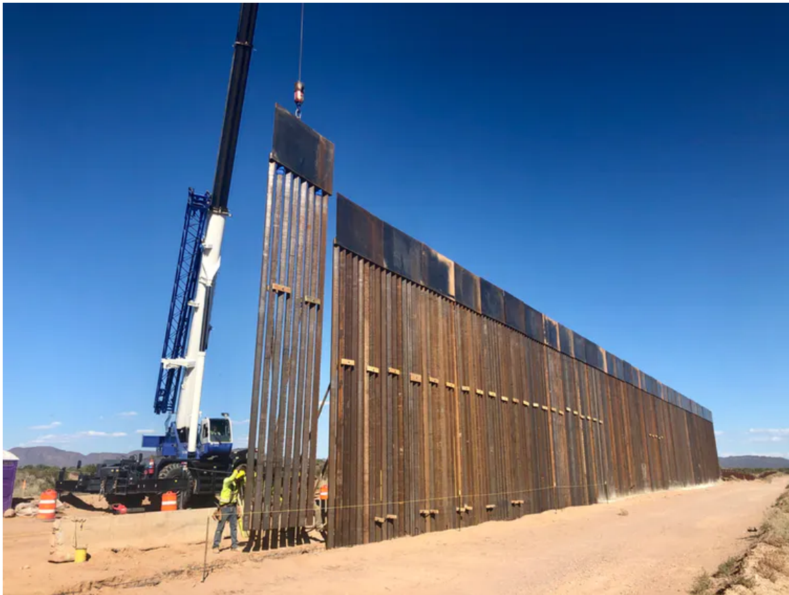
Border wall construction in Organ Pipe Cactus National Monument, Ariz.