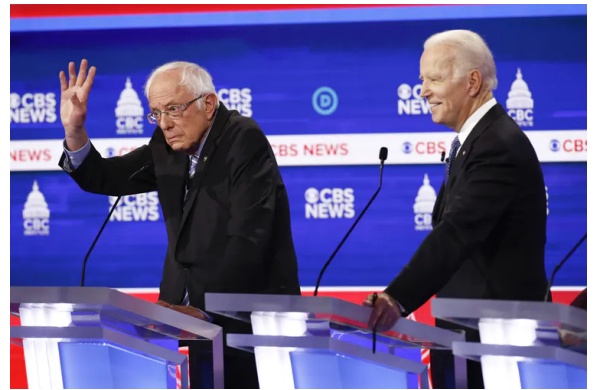
Bernie Sanders' climate plan would declare a national climate emergency, while Joe Biden's relies on executive orders, legislation and regulation.

[You're smart and curious about the world. So are The Conversation's authors and editors. You can read us daily by subscribing to our newsletter.]