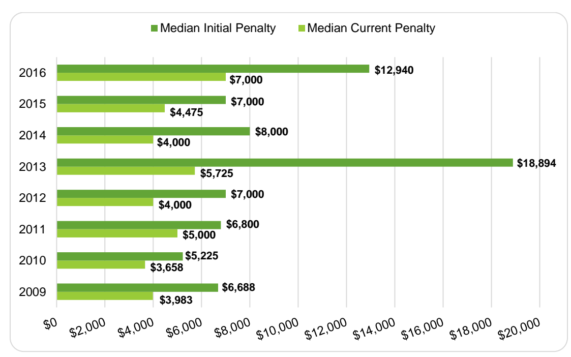
Figure 3. Initial vs. Current Penalties in Cases Against Poultry Processors

As stated in the previous section, it is noteworthy that this deduction is on top of the first penalty reduction based on the gravity of the violation and discounts based on an employer's size, history of violations, and good faith.