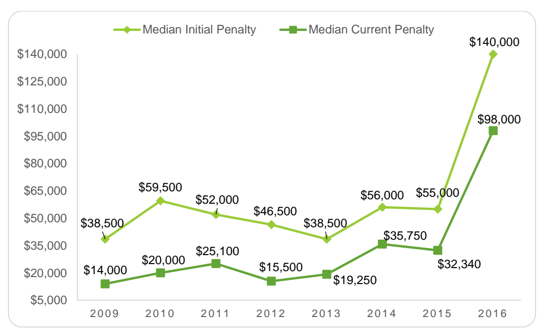
Figure 2. Initial vs. Current Penalties for Willful Violations in Complaint Cases

The amount deducted from initial penalties for willful violations cited in all 239 complaint investigations totaled $7.91 million. Again, this deduction is on top of the first penalty reduction based on the gravity of the violation and discounts based on an employer's size, history of violations, and good faith, as discussed earlier in this paper.