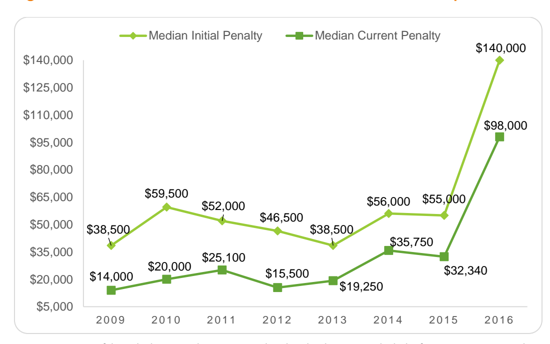
Figure 2. Initial vs. Current Penalties for Willful Violations in Complaint Cases

The amount deducted from initial penalties for willful violations cited in all 239 complaint investigations totaled $7.91 million. Again, this deduction is on top of the first penalty reduction based on the gravity of the violation and discounts based on an employer's size, history of violations, and good faith, as discussed earlier in this paper.